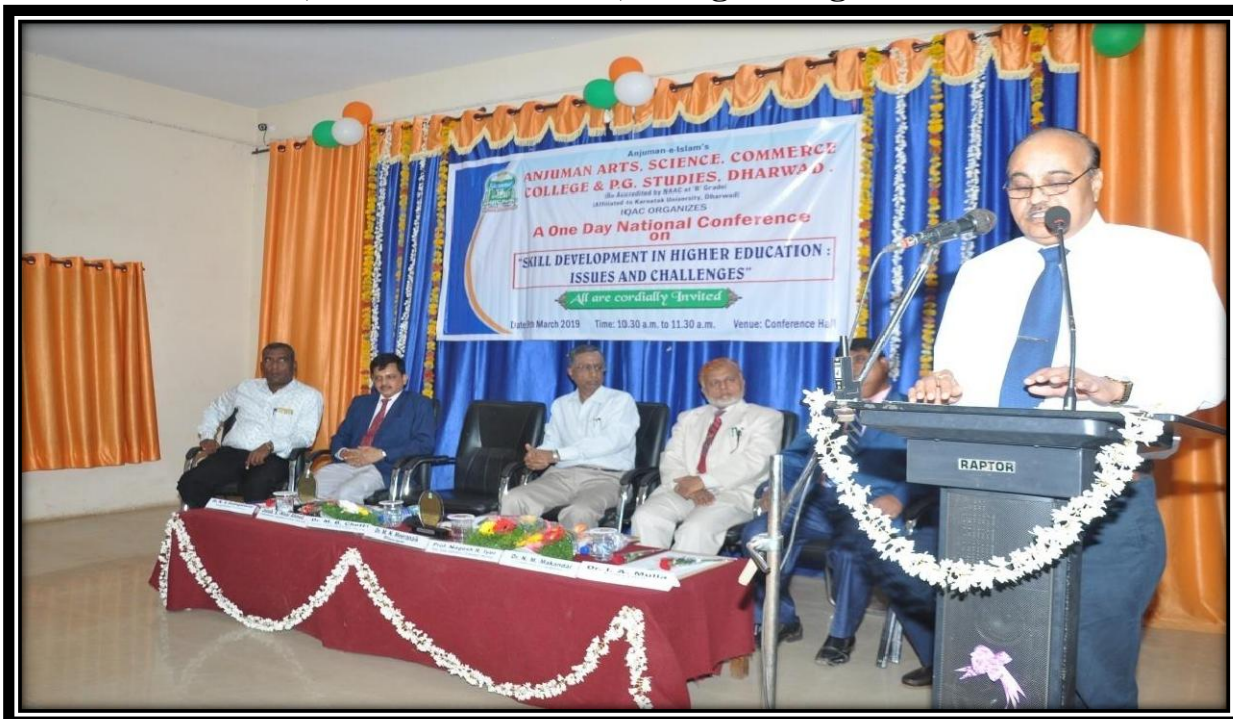
Inaugural Address by Vice Chancellor