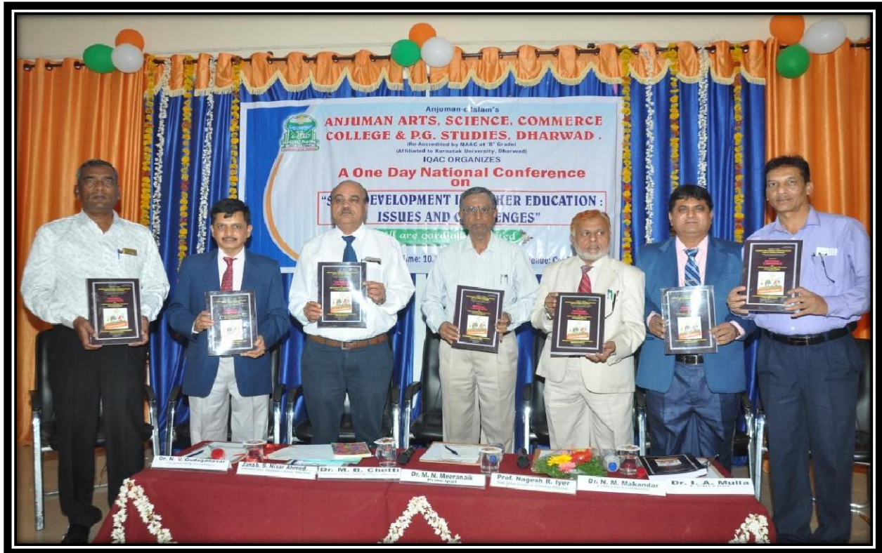
Special Issues on Paper Publication Released by the Guests