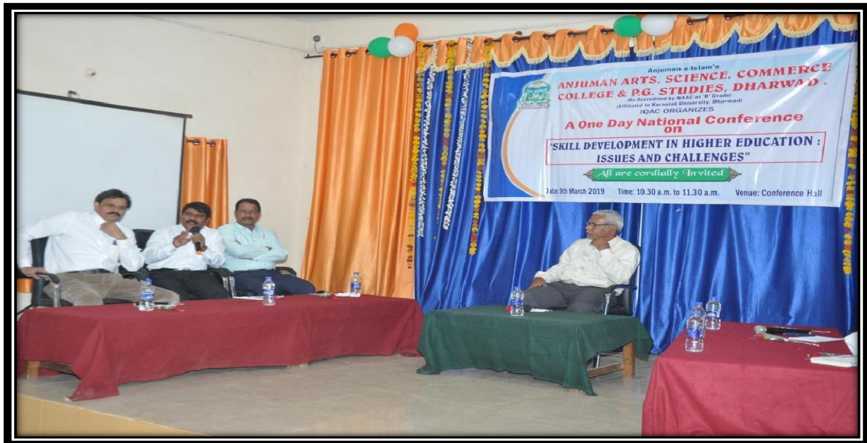
A panel discussion