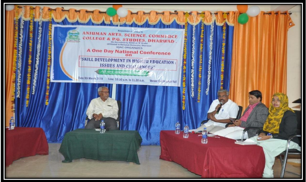
A panel discussion