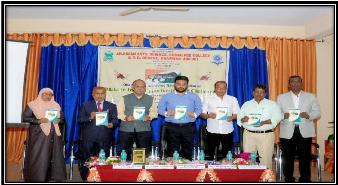
Proceedings of the Conference Released by the Guests