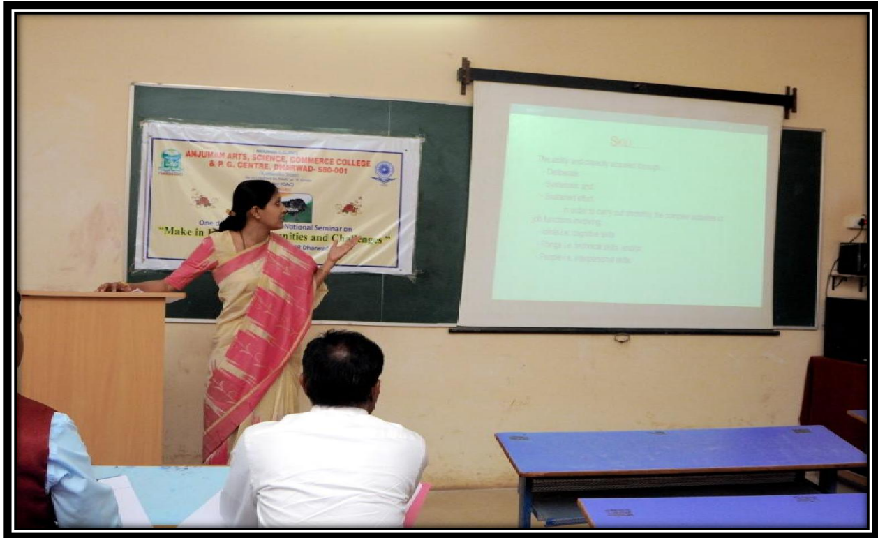
Paper Presentation By the Teacher Delegate