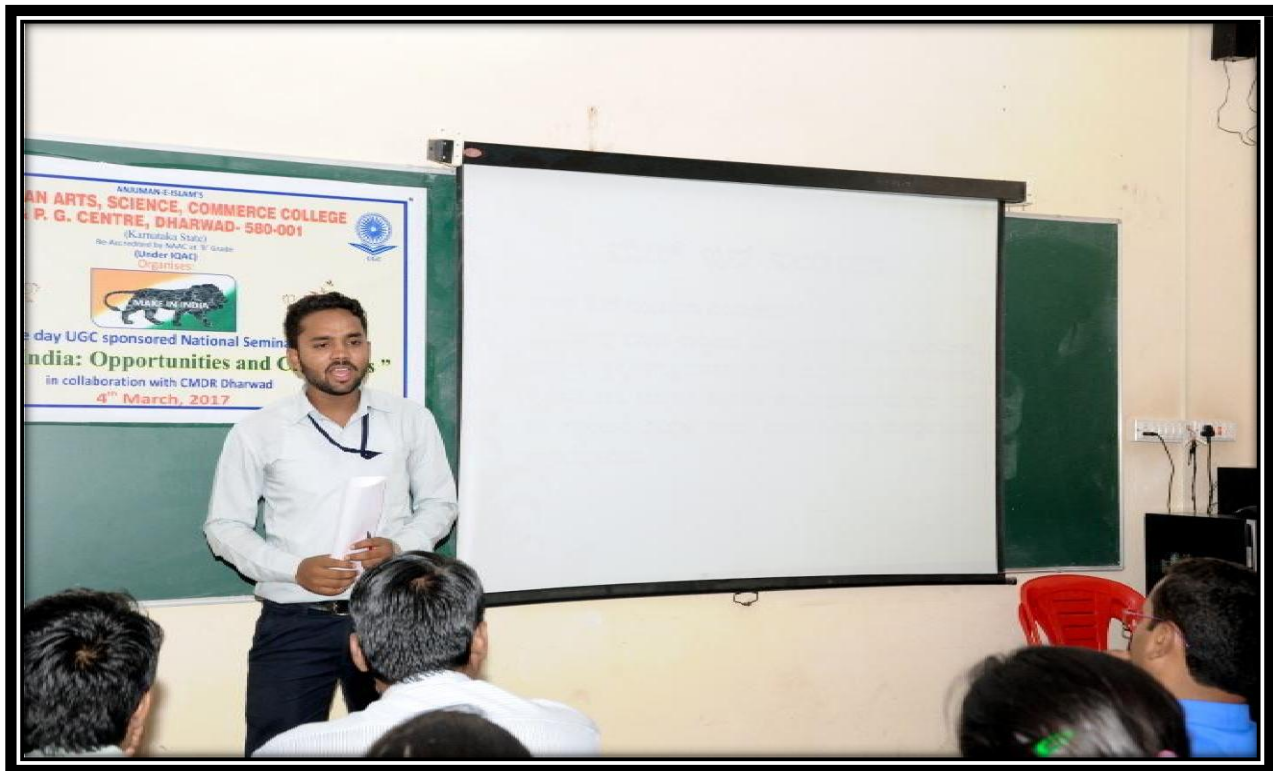
Paper Presentation By the Students