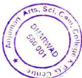
Principal Anjuman Arts Sc. & Com. College Dharwad